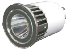
LED110 - 00